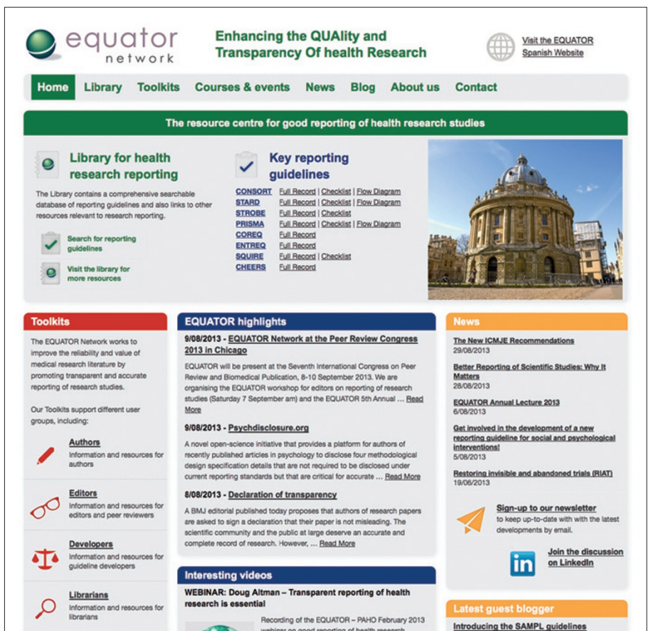
Figure 2. The equator network website home page