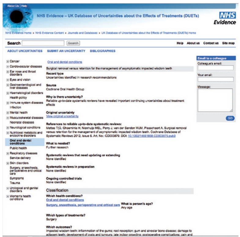
Fig. 2 Example page from the DUETs database: Surgical removal versus retention for the management of asymptomatic impacted wisdom teeth