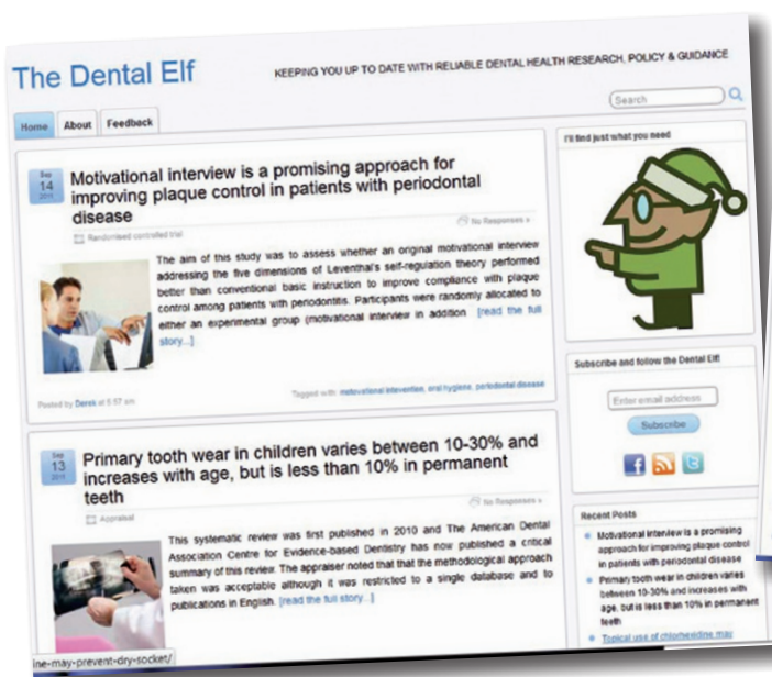
Figure 1 – The Dental Elf home page

The home page of Dental Elf has a brief introduction text (Figure 1) from which people can link to the full story (Figure 2). This provides links to the journal abstract and other relevant information. Many of the studies highlighted on the Dental Elf will go on to have commentaries written for the Evidence-based Dentistry Journal. In addition to new studies it will also highlight commentaries and appraisals of systematic reviews that are newly published on sites like the Centre for Reviews and Dissemination at York and critical summaries from the American Dental Association's Centre for Evidence-Based Dentistry ( http://ebd.ada.org/ ).