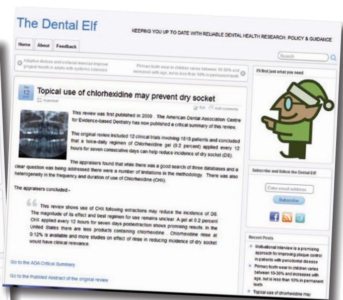
Figure 2 – A Dental Elf blog page