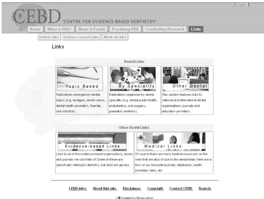
Figure 3. Centre for Evidence-based Dentistry — Links page.