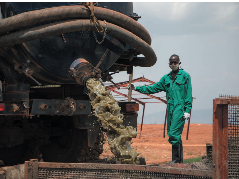
Sludge arriving at the Nduba landfill outside Kigali in Rwanda. The waste was once dumped into open pits, but now it is dried and sanitized for use as fuel.

charcoal-like fuel for use by a further 130,000. At Pivot's plant, workers make a solid fuel. They take most of the water out of the sludge by passing it through a microscreen. Then they spread it in greenhouses to dry. Finally, they further desiccate and sanitize it in a thermal dryer that runs on scavenged cardboard. The end result, provided as a powder or in granules, has 20% more energy than other biomass fuels such as sawdust or coffee husks, Muspratt says.