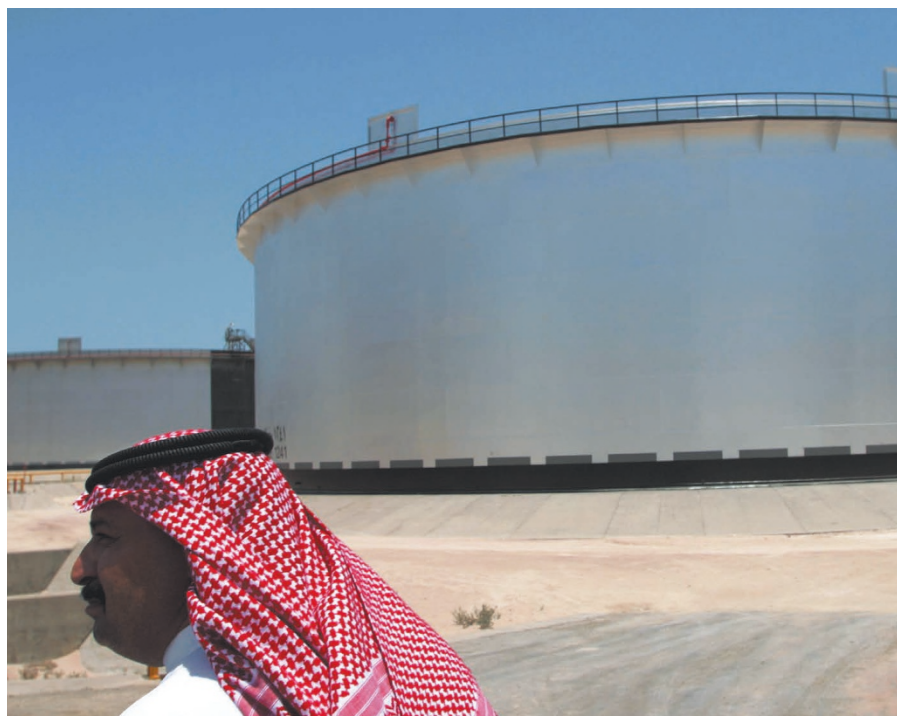
Oil-rich countries such as Saudi Arabia will take decades to reduce their reliance on fossil fuels.

Second, a global mechanism is needed to share information about climate-related investment risk. Investors will be able to plan and make better choices if they know the chances of an asset losing its worth. Financial markets need to be able to judge an energy investment over its lifetime. For