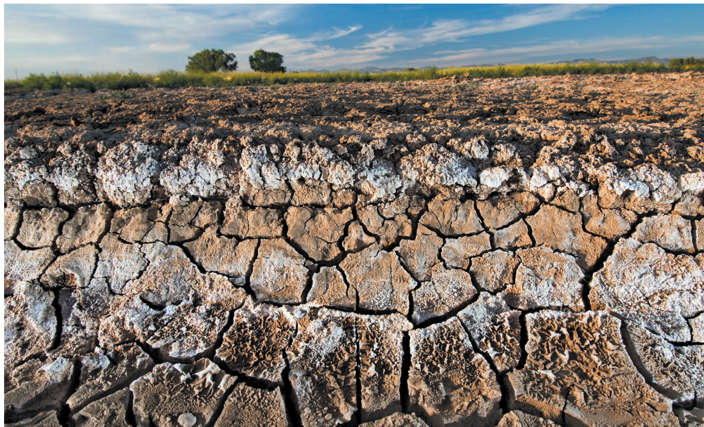
Salt in the soil in the Grand Valley, Colorado, leaches to the surface or is pushed up by groundwater.