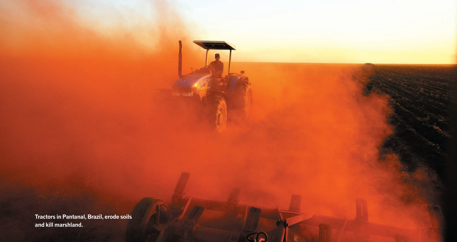
Tractors in Pantanal, Brazil, erode soils and kill marshland.