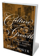
A Culture of Growth: The Origins of the Modern Economy JOEL MOKYR Princeton University Press: 2016.

Some think that the current rate will slow down. But very few see it coming to a rapid end, unless there is a nuclear war or an equivalent catastrophe. The slowing will come as low-hanging fruit is picked and resource scarcities bite; but resource exhaustion followed by crash, as described in Jay Forrester’s 1971 World Dynamics (Wright-Allen Press), is likely only in systems in which scarce resources are not rationed by high prices.