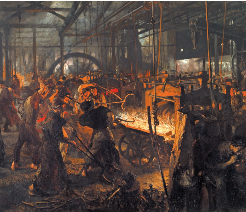
Adolph Menzel's 1873–75 The Iron Rolling Mill (Modern Cyclops) .