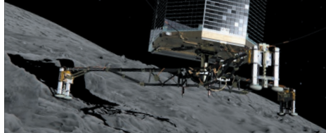
Rosetta's Philae lander touches down on a comet.