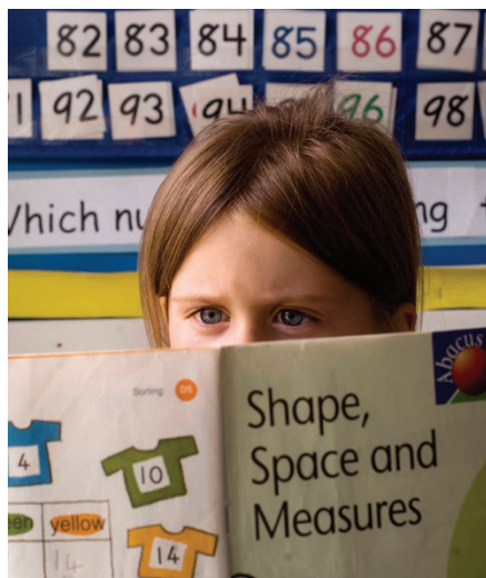
Genetic differences explain just 3.2% of the variation in educational achievement between people.

Yet the study's authors estimate that the 74 genetic markers they uncovered comprise just 0.43% of the total genetic contribution to educational achievement (A. Okbay et al. Nature http://dx.doi.org/10.1038/nature17671 ; 2016). By themselves, the markers cannot