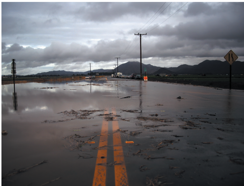
El Niño has sent heavy rains to California this year.