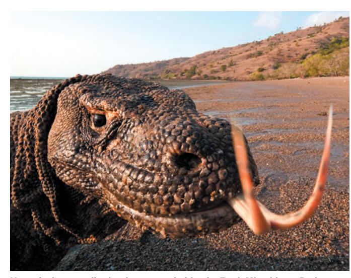
Komodo dragon saliva has been sampled for the Earth Microbiome Project.

In November, the United States will elect a new president. If a Republican takes the White House, long-debated plans to bury nuclear waste at Yucca Mountain in Nevada may well resurface, and federal funding for climate and social science could face the chop.