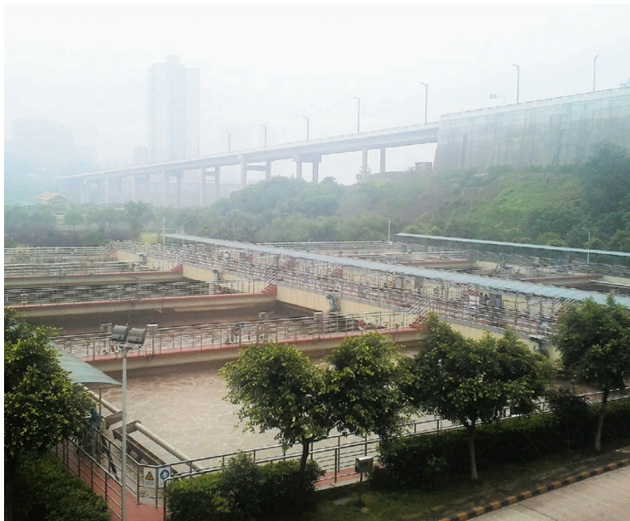
A treatment plant in Chongqing, China, which processes 40,000 cubic metres of wastewater per day.