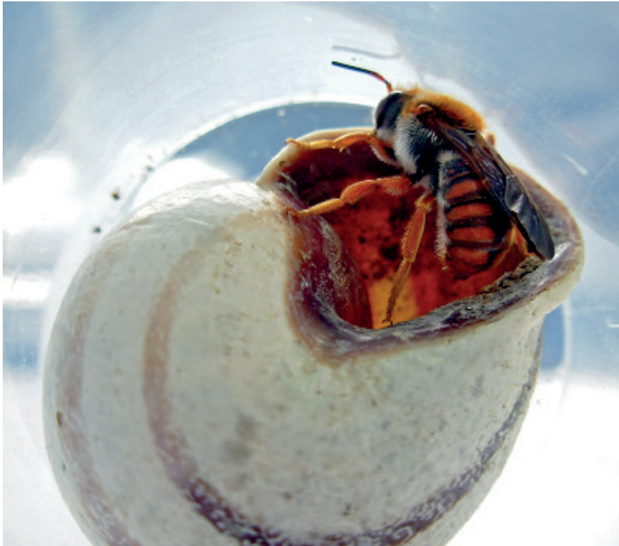
A male mason bee, Rhodanthidium sticticum , makes its nest in the empty shell of an Otala snail.