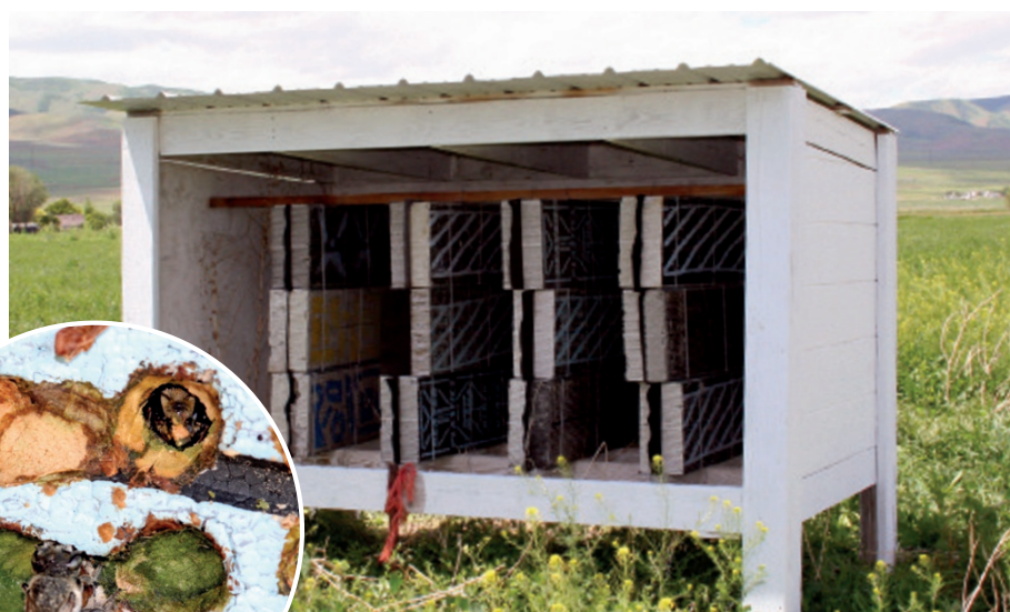
A purpose-built shelter with polystyrene nesting boards for the alfalfa leafcutter bee, Megachile rotundata (inset), in an alfalfa field in Utah.

has worked in the United States to develop techniques for managing these and other species of wild bee. He says many research questions remain about which types of wild bees interact with which species of agricultural flowering plants — “And above all, why?” he asks.