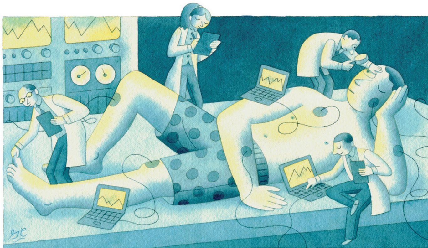
ILLUSTRATION BY GREG CLARKE

SPRING BOOKS Grind, politics and dirty tricks in life of polio-vaccine pioneer p.620