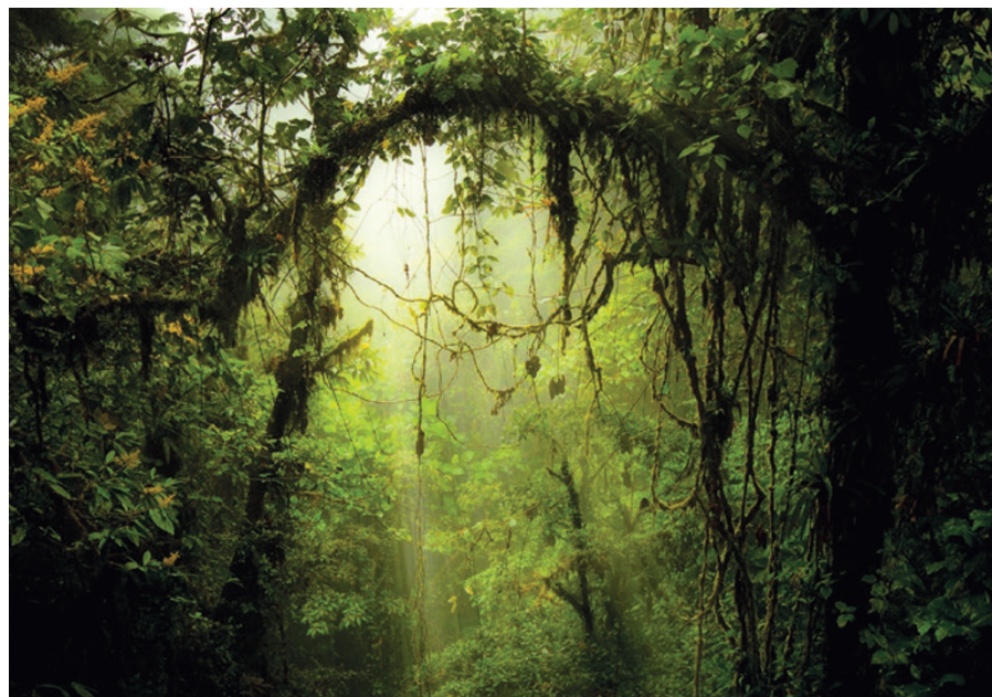
Conservation efforts risk getting snared in a tangle of aims.

AUTOBIOGRAPHY Carl Djerassi, father of the Pill, reflects on his life and literature p.36