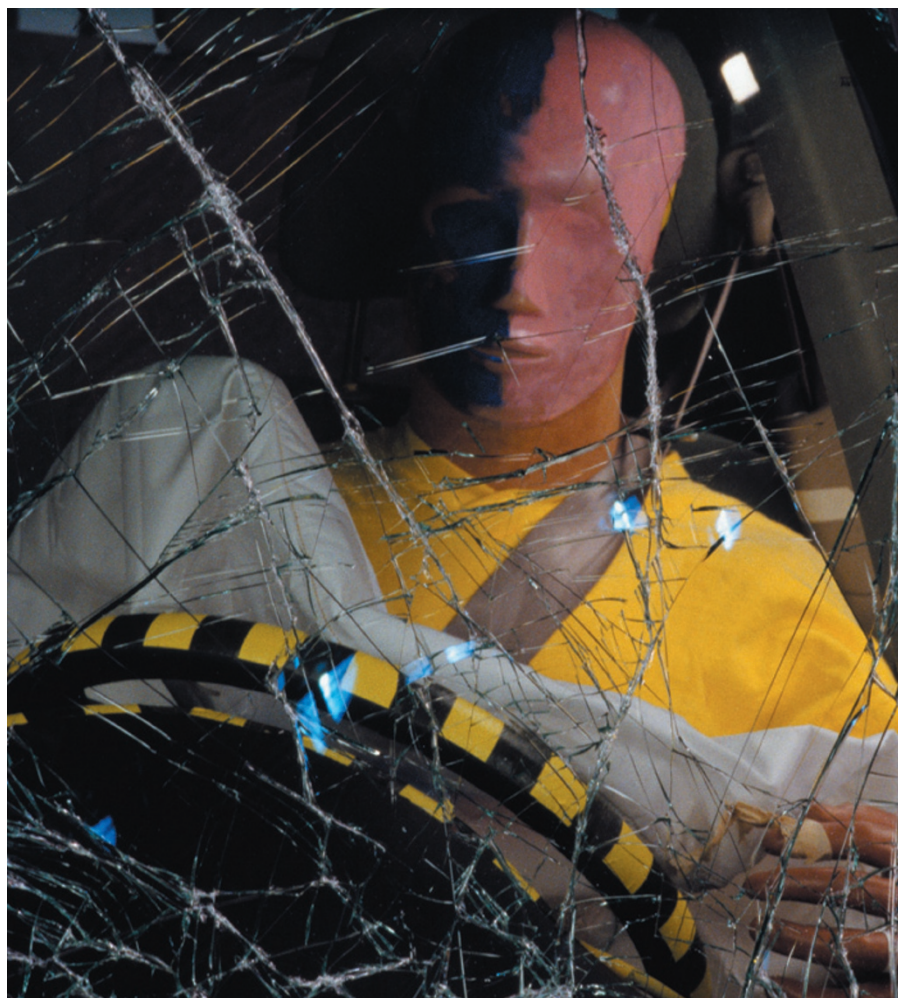
Early airbags were dangerous to women and children, having been designed for adult men.