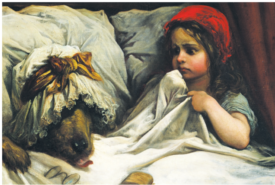
LITTLE RED RIDING HOOD BY GUSTAVE DORE/NATL. GALLERY OF VICTORIA, MELBOURNE, AUSTRALIA/BRIDGEMAN ART LIBRARY

The next step is to find a reliable way to connect the nuclear spin state memory to the electronic spin states of atoms, which are more likely to be used in quantum computer