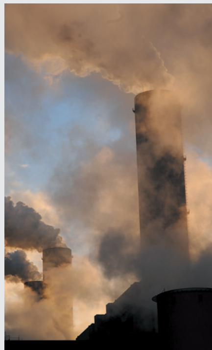
Gas drilling in Pennsylvania; solar-panel installation in Jiuquan, China; a coal plant in Grevenbroich, Germany's 'energy capital'.