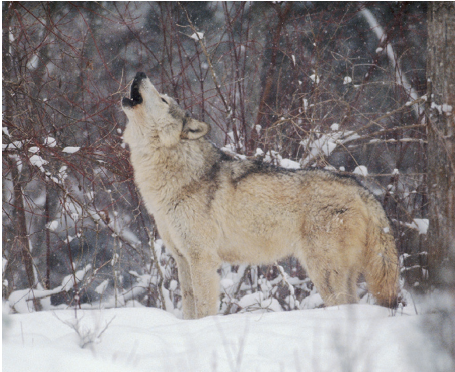
The grey wolf, protected for more than 30 years, could see its endangered status removed nationwide.