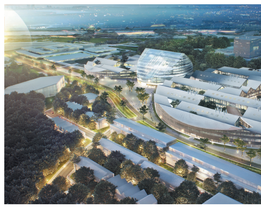
The Skolkovo Institute of Science and Technology will open near Moscow next year (artist's impression).