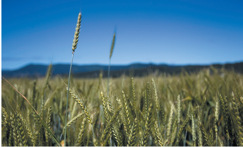
Wheat in a test field at Oregon State University where scientists are helping to identify a rogue GM crop.

It is not yet clear whether Obama's plan will be paid for by Congress, which has been locked in a battle with the administration over agency goals ever since NASA gave up former President George W. Bush's vision of returning to the Moon (see Nature 492, 161–162; 2012). A bill proposed by a congressional subcommittee on space in the Republican-dominated House of Representatives would cancel all funding for the asteroid initiative. ■