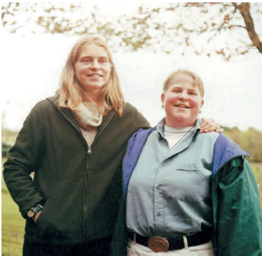
The identical twin on the right was given various treatments as a child for acute lymphoblastic leukaemia.