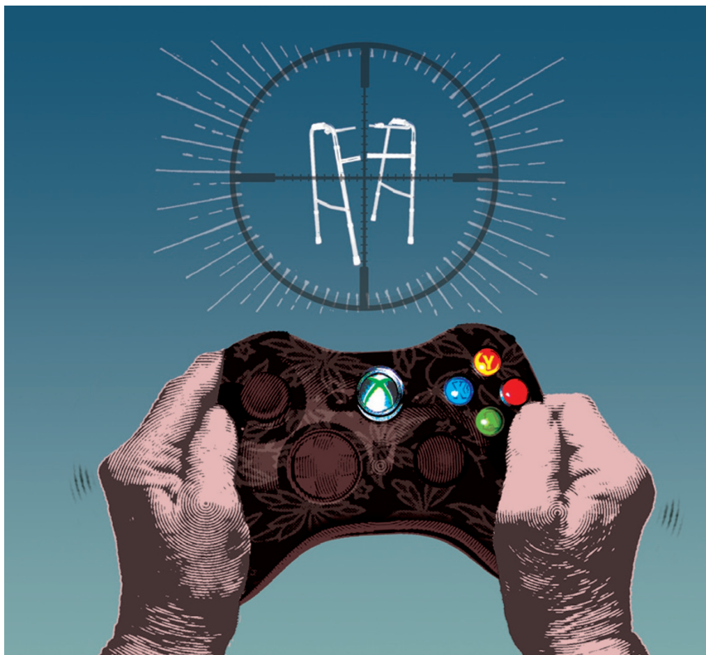
ILLUSTRATION BY ANDY MARTIN