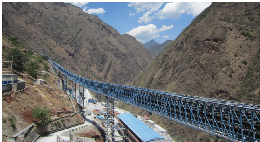
A conveyor belt removes rock from JinPing laboratory, a 2,500-metre-deep dark-matter experiment site.

Ongoing experiments in Italy, the United States and Japan are now being joined by a fourth in China, called PandaX (see 'Dark and deep'). Installed in the deepest laboratory in the world, 2,500 metres under the marble mountain of JinPing in Sichuan province, PandaX will this year begin monitoring 120 kilograms of xenon. The team hopes to scale the tank up to 1 tonne by 2016, which would mean that the experiment had developed more quickly than any other dark-matter search. "We want to demonstrate