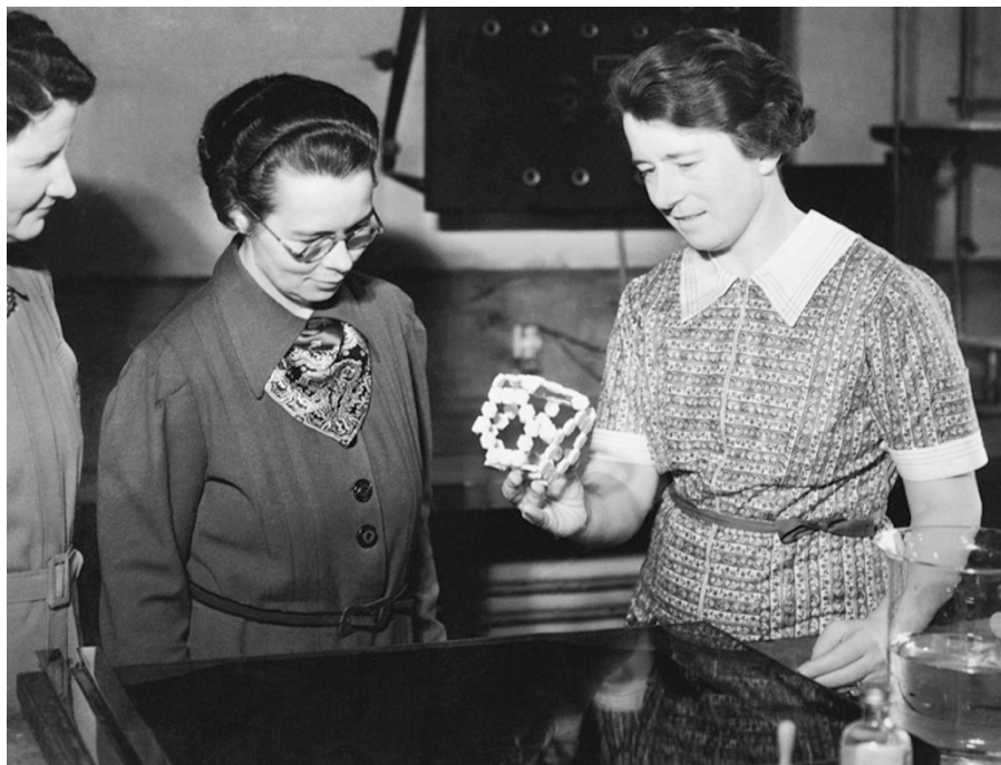
Dorothy Wrinch (right) with her model of protein structure in 1938.