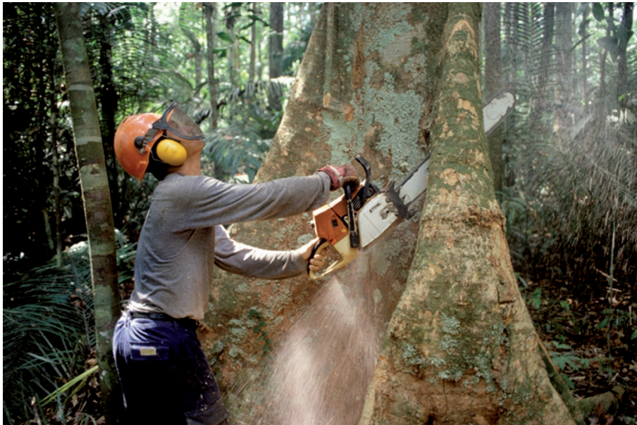
Brazilian scientists are trying to understand the effects of logging on carbon emissions in the Amazon.