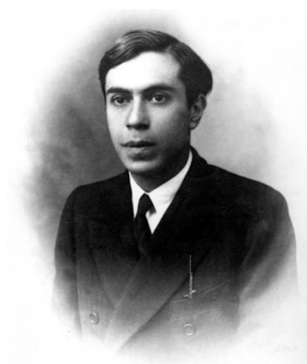
Ettore Majorana predicted non-Dirac antiparticles.