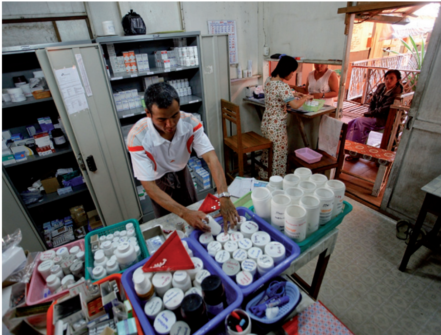
Plans to provide drugs for people with HIV in Myanmar are being scaled back through lack of funds.