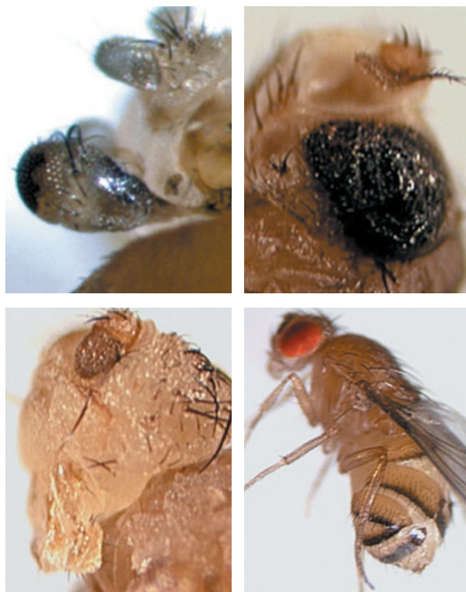
The mutations responsible for these flies' deformities are present in normal-looking flies, but their effects are usually hidden by 'chaperone' proteins.