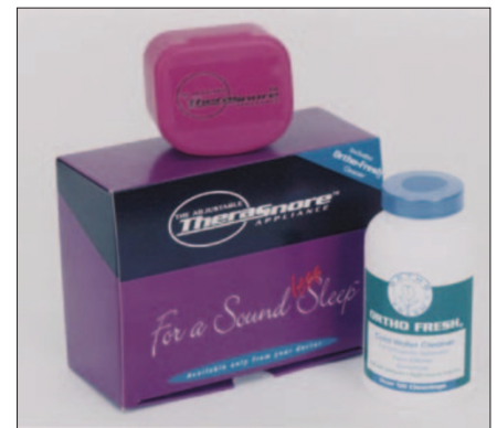
Reader response number 77

Distar, manufacturer of Adjustable TheraSnore anti-snoring appliance has recently announced the product is now available in different sizes. The Adjustable TheraSnore treats mild to moderate sleep apnea as well as simple snoring. The new sizes will still be fitted in the surgery in 30 minutes or less without the need of any models, impressions or laboratories and are still adjustable in precise 1.5mm increments with out the need to refit the appliance. Distar will be exhibiting at stand C13.