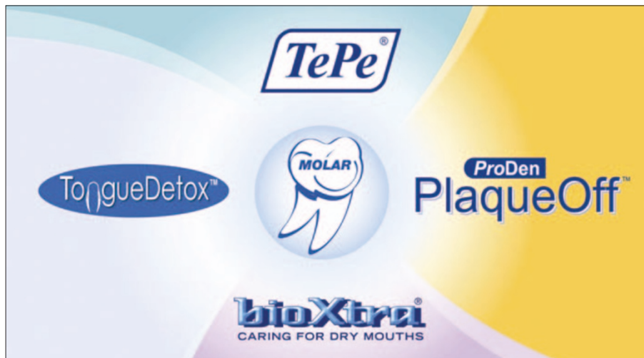
Reader response number 78

For the 2006 BDTA Molar are bringing the profession new, innovative and never seen before products. Molar's launch will take place at stand G16 so visitors can come and get involved in the pink initiative.