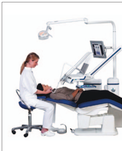
Reader response number 80

Anyone ordering a UniLine Treatment Centre, before 1 December 2006, can receive a free trip to "Wonderful Copenhagen" to design their own bespoke unit and visit the Tivoli Christmas Market. Visitors to the stand will also see Climo cabinetry, available in prestige standard or individually designed presentations. Climo offer a full-service from 3D CAD visual design to final set-up and installation.