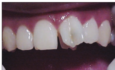
Figs 1-2 Upper left central incisor with an 'X' shaped appearance.

paediatric dentistry clinic at the University of the West Indies. The patient had no other anomalies, a full complement of permanent teeth with moderate caries and was concerned about the appearance of her front tooth.