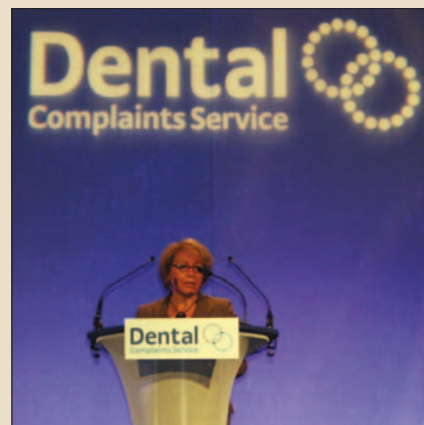
Rosie Winterton MP, Minister of State for Health Services at the launch

Dissatisfied dental patients who call the Dental Complaints Service will first be encouraged to use their dental practice's own complaints procedures, if they have not already done so. If a complaint remains unresolved, Dental Complaints