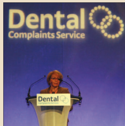
Rosie Winterton MP, Minister of State for Health Services at the launch

Dissatisfied dental patients who call the Dental Complaints Service will first be encouraged to use their dental practice's own complaints procedures, if they have not already done so. If a complaint remains unresolved, Dental Complaints