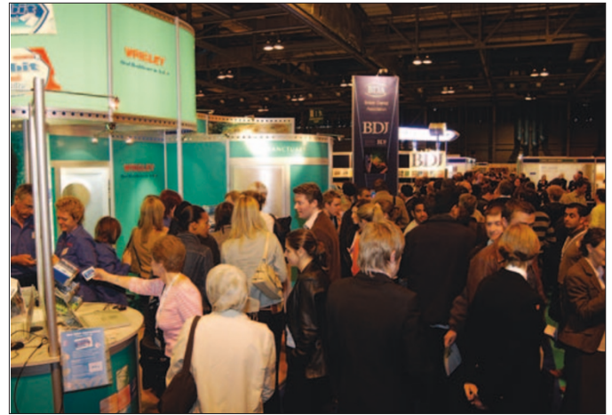
There was something for everyone at the trade exhibition