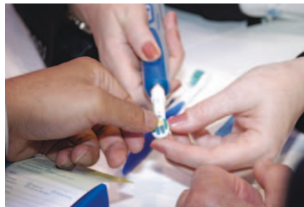
Exhibitor demonstrates an electric toothbrush