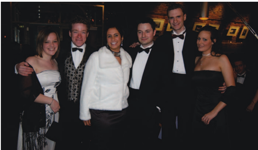
This year's VDP ball took place in The Arches, a venue under Glasgow central station. The theme for this year's ball was James Bond films