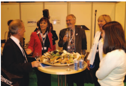
Delegates socialise between lectures