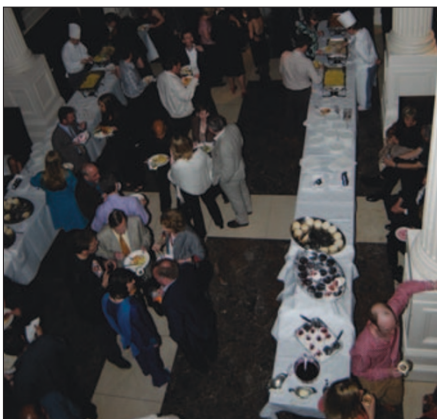
One of this year's parties was at the lavish Corinthian nightclub, once the venue for Glasgow's High Court