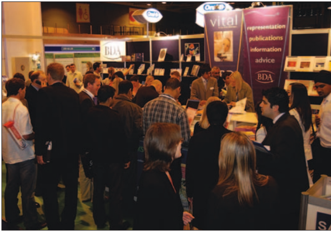
The BDA book stand was well attended throughout the conference