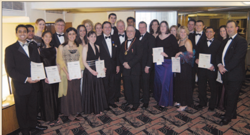
The winners at the 2005 BDA / Dentsply Student Clinician Programme awards

Each of the participants was honoured at the annual dinner, this year held at London's Savoy Hotel.