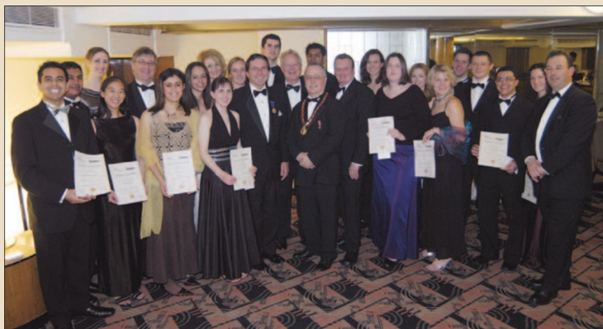
The winners at the 2005 BDA / Dentsply Student Clinician Programme awards

Each of the participants was honoured at the annual dinner, this year held at London's Savoy Hotel.