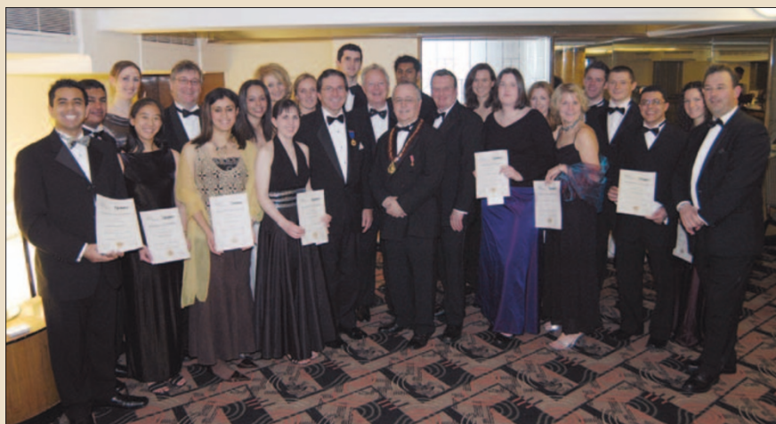
The winners at the 2005 BDA / Dentsply Student Clinician Programme awards

Each of the participants was honoured at the annual dinner, this year held at London's Savoy Hotel.