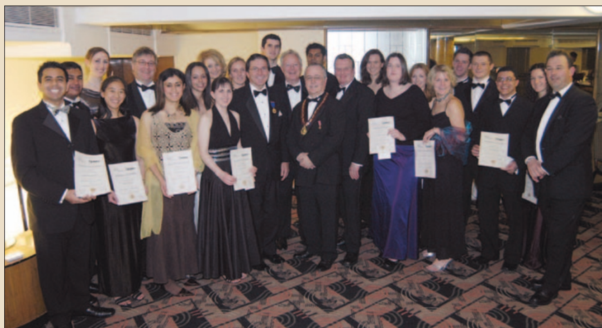
The winners at the 2005 BDA / Dentsply Student Clinician Programme awards

Each of the participants was honoured at the annual dinner, this year held at London's Savoy Hotel.