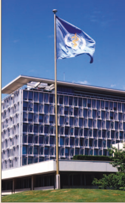
WHO Headquarters in Geneva

A public health treaty which may contribute to the reduction of tobacco consumption worldwide will become part of international law on 28 February 2005. The World Health Organisation Framework Convention in Tobacco Control has been ratified by 40 countries – including those within the European community – in the past 17 months.