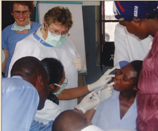
The team gather to teach from an interesting case

Dentaaid and Bridge2Aid are planning further visits to Tanzania, with the next trip in May 2005. Details of how to apply can be found at Dentaaid's website at www.dentaaid.org .