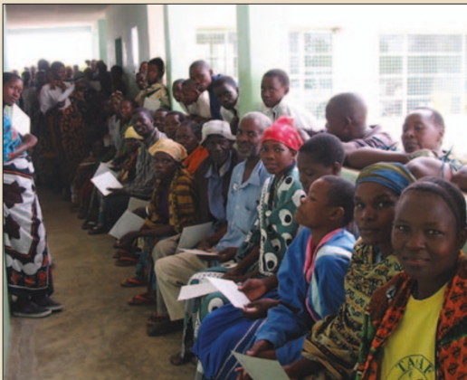
Over 120 patients turned up for treatment on the last day

DentaAid and Bridge2Aid are planning further visits to Tanzania, with the next trip in May 2005. Details of how to apply can be found at DentaAid's website at www.dentaaid.org .