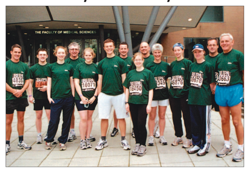
Around 35 dentists, dental nurses and keen supporters donned green t-shirts to run 13 miles on behalf of dental charity Dentaid in the Great North Run, raising funds of £10,000. The money will be used to fund surgeries and oral health programmes all over the developing world.