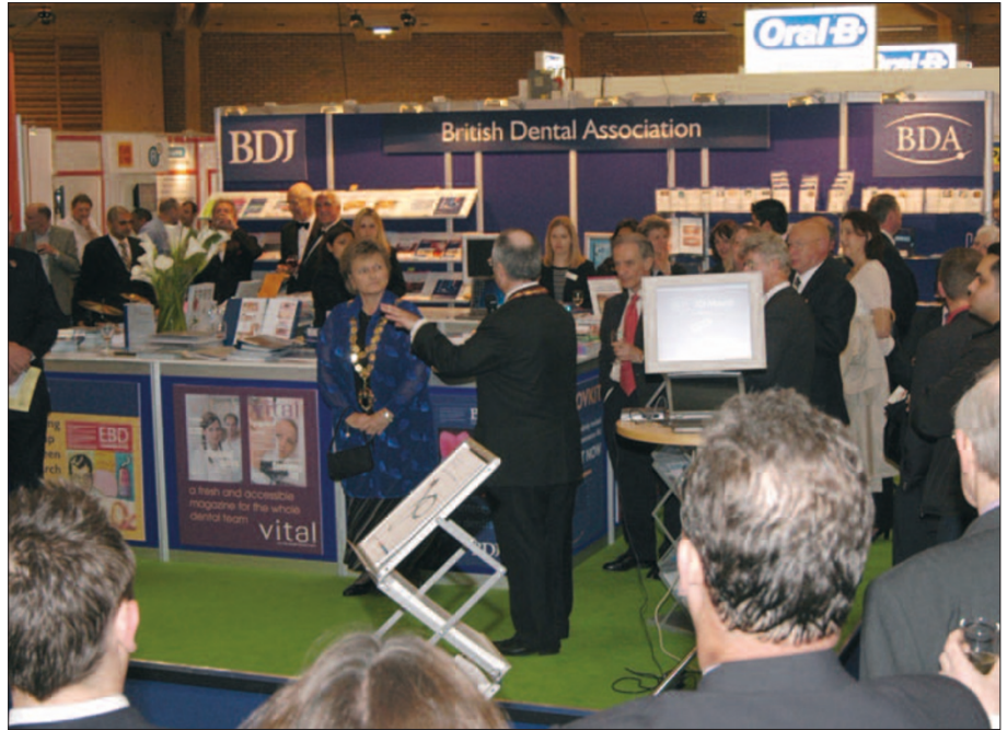
Exhibition Drinks Reception by the BDA Stand with Councillor Ann Rey, Lord Mayor of Bournemouth