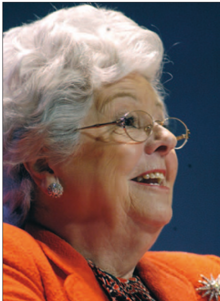
Lady Betty Boothroyd speaks on The opportunity of change , emphasising 'the importance of a clear vision' and how to 'survive and thrive in a demanding political context'