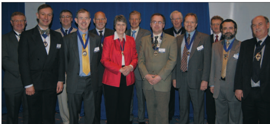
BDA Branch Presidents and Group Presidents from throughout the UK