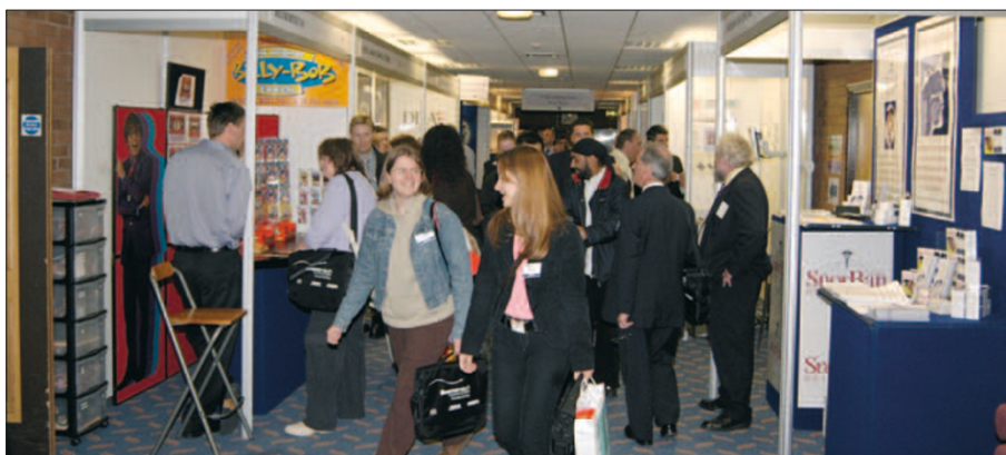
Delegates complete their tour of the Exhibition