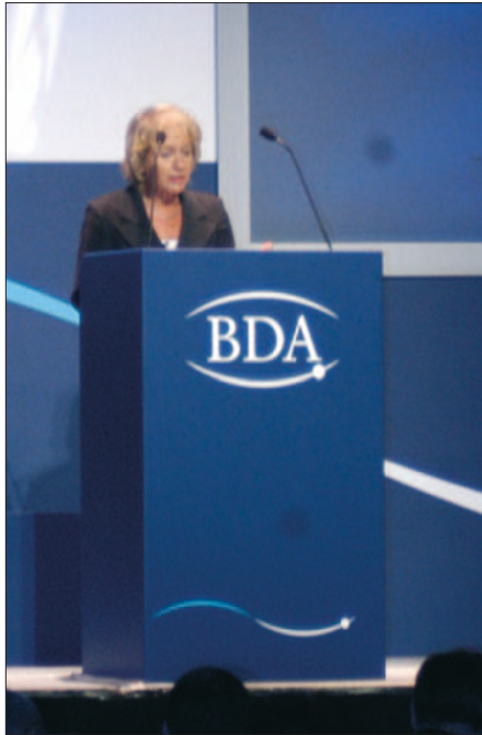
Rosie Winterton MP, Minister of State at the Department of Health speaks on The Government's vision for dentistry