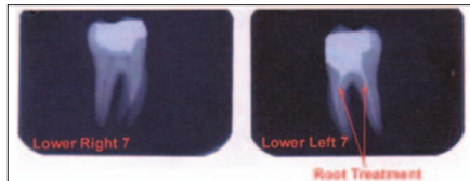
The two lower second molars showing the extent of the amalgams. Lower left 7 has been root filled