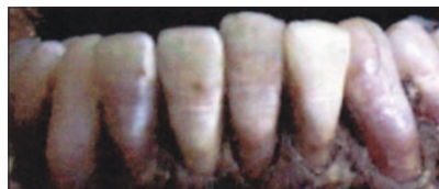
'X' = UL2 missing following post mortem