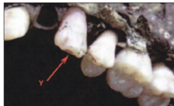
Photograph demonstrating incisal tooth wear on UL3