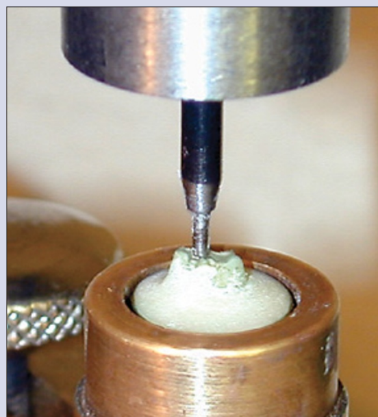
Fig. 3 Test apparatus used for retention test.