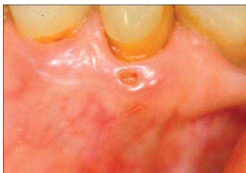
Fig. 3 Abfraction

removed as a result of opposing tooth surfaces contacting during function or parafunction. Such direct contact occurs at proximal areas, on supporting cusps and on guiding surfaces during empty grinding movements.