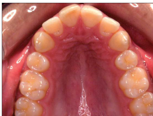
Fig. 1 Purely physiological tooth surface loss

© British Dental Journal 2002; 192: 11–23