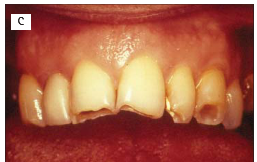
Fig. 5: Fig. 5a shows a young patient (18 years), who needs treatment, whereas in Fig. 5b a similar amount of TSL in an older (75 years) patient does not necessarily warrant intervention. The patient in Fig. 5c is 45 years old and his request for treatment is justified