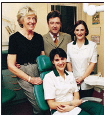
The Airthrey Park dental team

Funded by the Government's Scottish Dental Access Initiative, the centre is living up to the promise of the scheme by registering 2,200 student patients — well over the 1,500 NHS patients required.