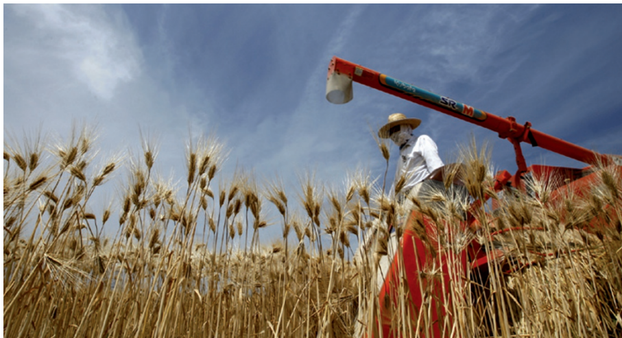
Japanese wheat farmers are unlikely to reap a radioactive harvest in future years.