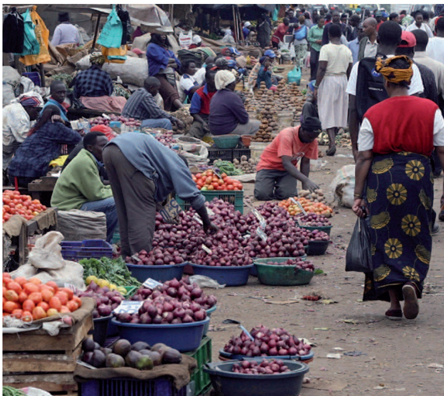
Despite the bounty in this Kenyan market, Africa suffers from poor infrastructure and low productivity.