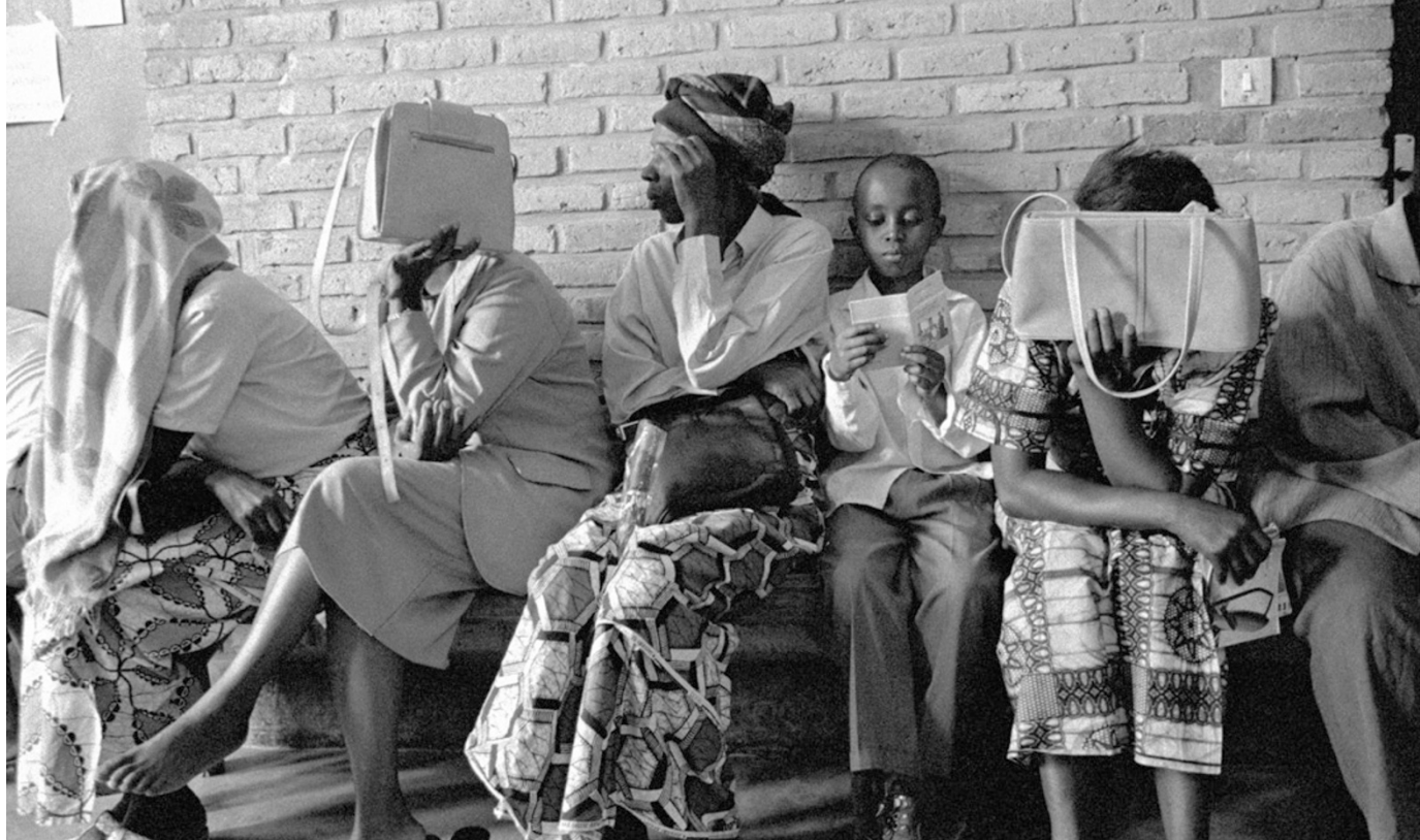
Women attending an HIV clinic in Rwanda avoid the camera.